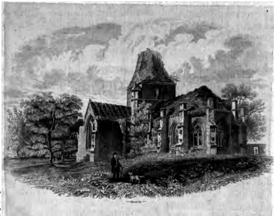
CHURCH OF SEYTON.

famyn; I fall fet furth sic doingis done be him als larglie and weill extendit till his disprayfe as I haue done in ony thing befoir faid to his loving, he nocht amendand and redressand the famyn in his lyftyme, gif God fortounis me to leiff and be hable thairto. Bot I pray God, that the faid Lord fall nocht in sic inconuenientis, to gif me, or ony man, occaifioun to wryt ocht of him bot honorable.